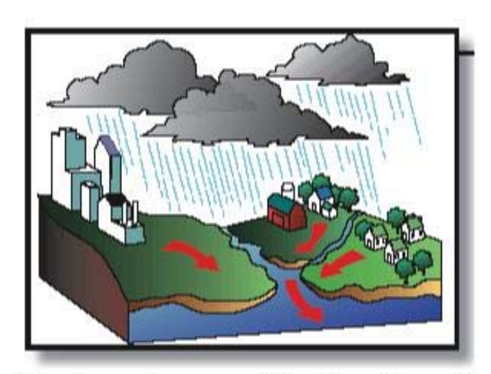
Drainage Areas and Surface Runoff

Calculation of peak storm water runoff rate from a drainage area is often done with the Rational Method equation (Q = CiA). Calculations with the Rational Method equation often involve determination of the design rainfall intensity and the time of concentration of the watershed as well. An Excel spreadsheet for making these types of calculations is included with this course. Example calculations and examples using the course spreadsheet for Rational Method equation calculations and for determination of the design rainfall intensity and the time of concentration of the drainage area, are presented and discussed in this course. The parameters in the equations are defined with typical units for both U.S. and S.I. units.